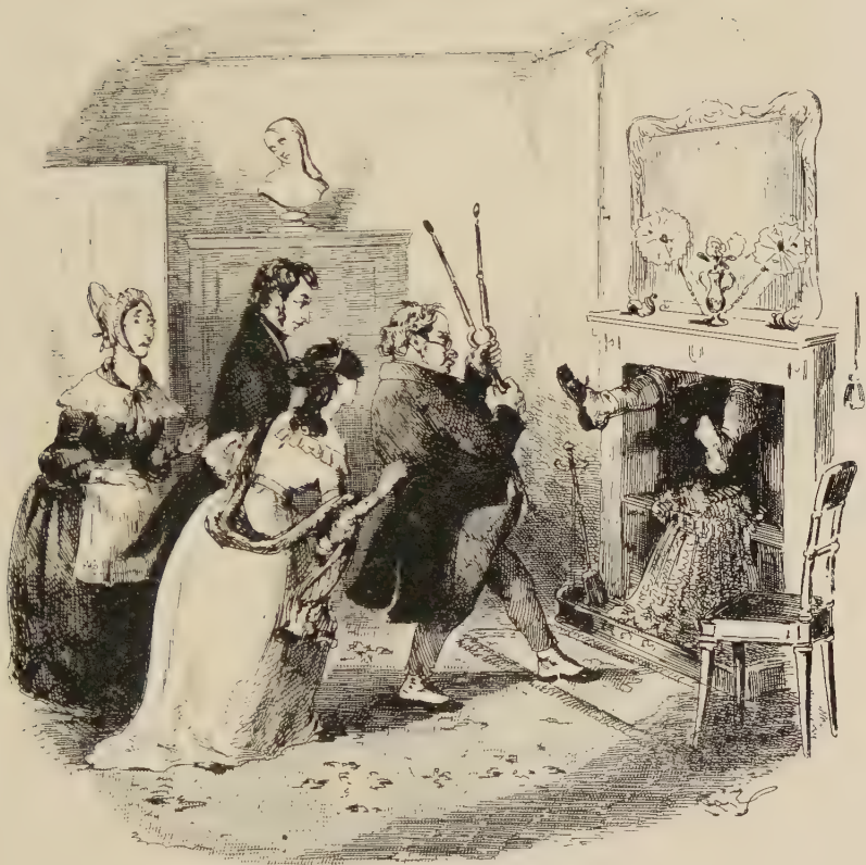
MYSTERIOUS APPEARANCE OF THE GENTLEMAN IN SMALL-CLOTHES.